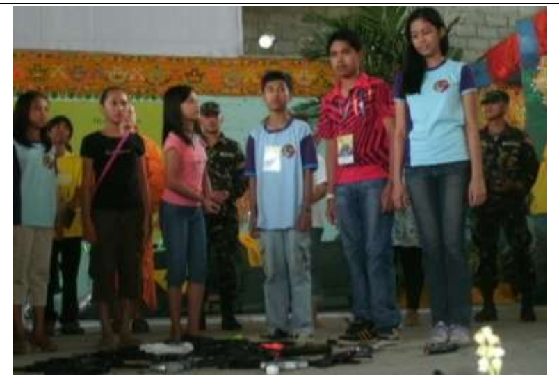
The participants are asked to give up their toy guns as their symbolic way of saying "No" to violence. This rite has been a tradition of the annual activity in the division, the "Peace Village Residential Experience" of which the students of this school always participate.