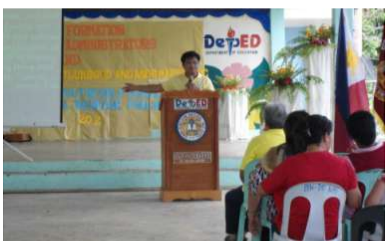
Municipal Mayor Joselito Miquiabas served as a resource speaker during the Division Values Formation for public school administrators hosted by the school.