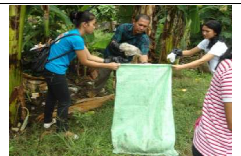
Students and teachers alike work hand in hand in making the town clean during one of the school's community cleanup activities.